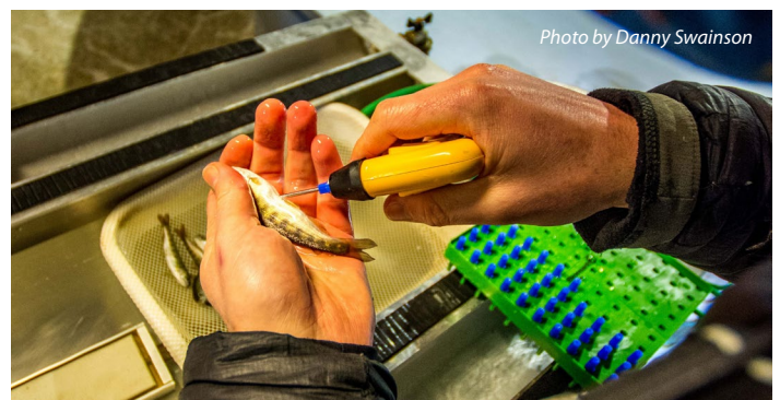
PIT tag implantation in a juvenile Coho salmon