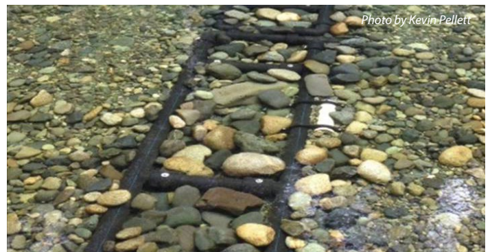
PIT antenna in the Cowichan River