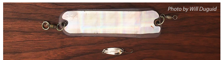
Microtrolling tackle — flasher and spoon

Despite a widely held belief that the first winter in the ocean plays a critical role in regulating salmon survival, there is a conspicuous lack of data on the winter habitat, diet, and health of these fish. A primary focus of the Bottlenecks project is to understand if, and how, the first winter at sea regulates survival of both hatchery and wild fish. To address this objective, a detailed study is being conducted in partnership with UVic to specifically examine the winter habitat use, diet, pathogen load, immune status, and bioenergetics of juvenile Chinook salmon. By sampling juvenile Chinook Salmon from October to March, researchers will develop the first complete picture of how these fish use their environment during the winter. The condition and energy content of individual fish will be related to their previous growth history (determined from scales) and their disease status (as indicated by cutting edge molecular genetic techniques). Integrating results will provide insight into how winter conditions may interact with pathogens and growing conditions during the previous summer to control survival. Results will be incorporated into models that will simulate the response of Chinook salmon to changes in winter ocean temperatures due to climate change.