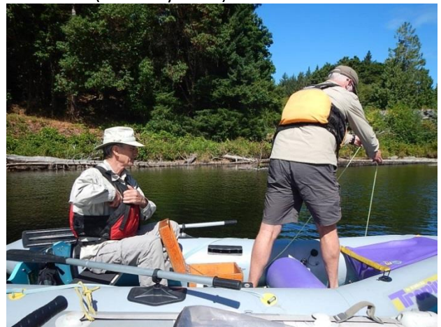
Photo 4: Volunteers deploying the 1 L Van Dorn water sampler at SWMP-03 (August 24, 2017).