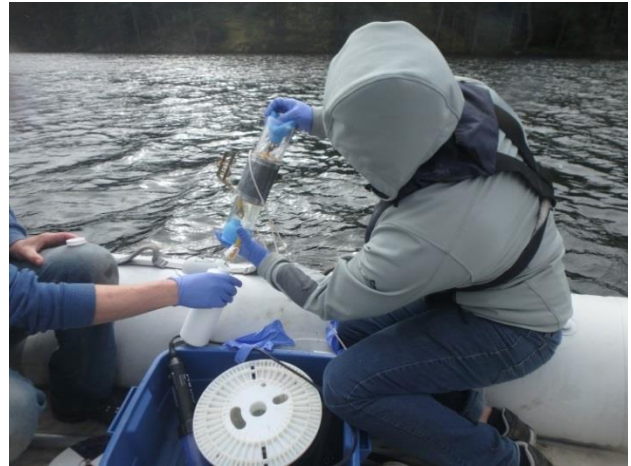
Photo 2: BCCF staff collecting water samples at SWMP-03 (February 2017).