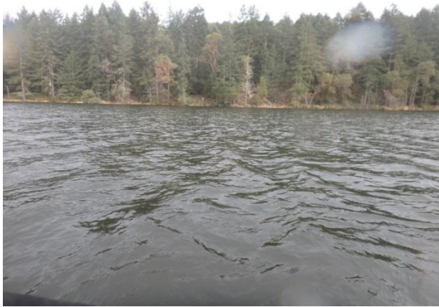
Photo 1: Looking southwest at typical shoreline habitat along south shore of lake (February 2017).