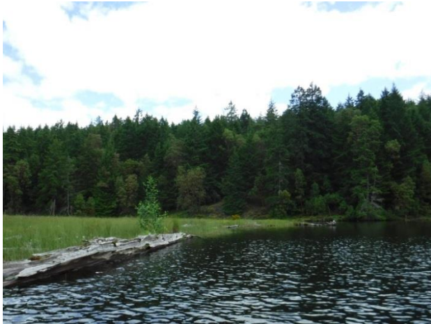
Photo 5: Looking northeast at eastern edge of marsh island (June 2017).