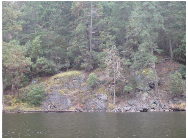
Photo 8: Looking northeast at rocky banks on northern lake shore (November 2017).