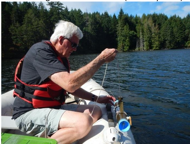
Photo 3: Volunteer deploying the 1 L Van Dorn water sampler at SWMP-03 (August 24, 2017).