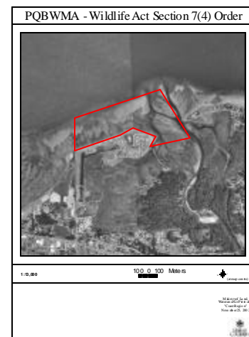
Figure 3-2: Area subject to public access closure order

In early 2003, MWLAP proclaimed an order under section 7(4)(a) of the Wildlife Act 5 that closed a portion of the P-QBWMA, from the mainstem of the Englishman River to the east boundary of the Parksville's Community Park, to public access from March 1 to April 30 (Figure 3-2).