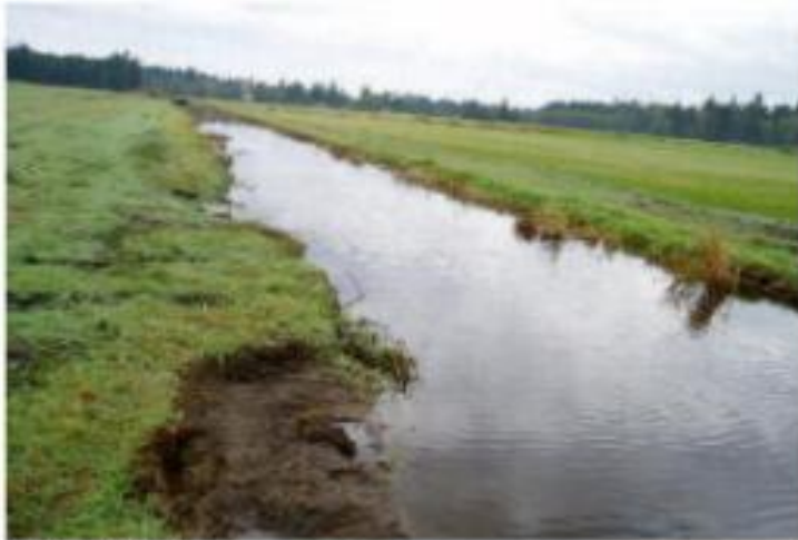
Morison Ck R2