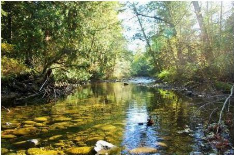
S. Eng. R. US