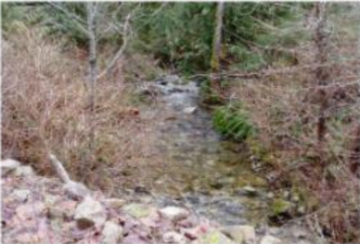
Morison Creek R1