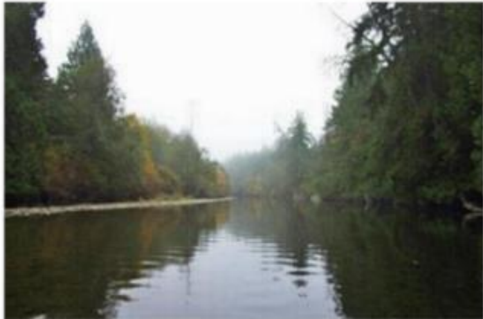
Reach E2 US