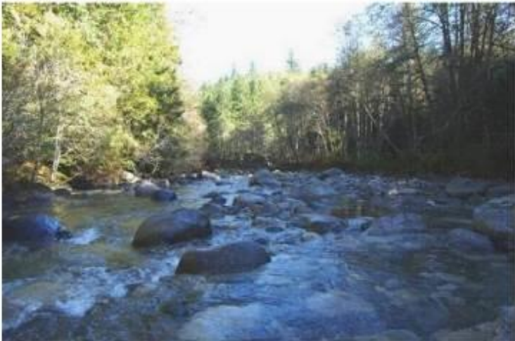
Reach E8 DS