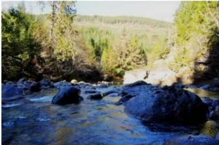
Reach E9 US