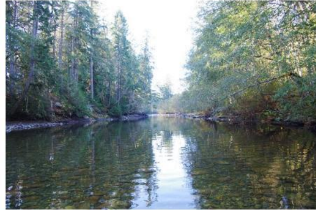
Reach E4 US