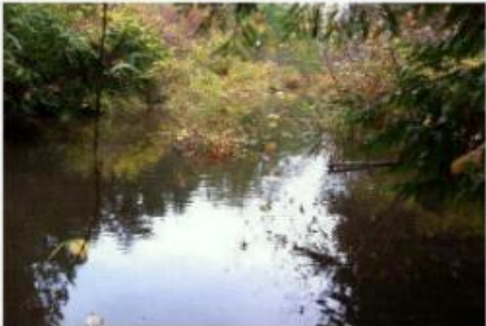
Shelly Creek R2