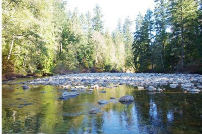
Reach E4 DS