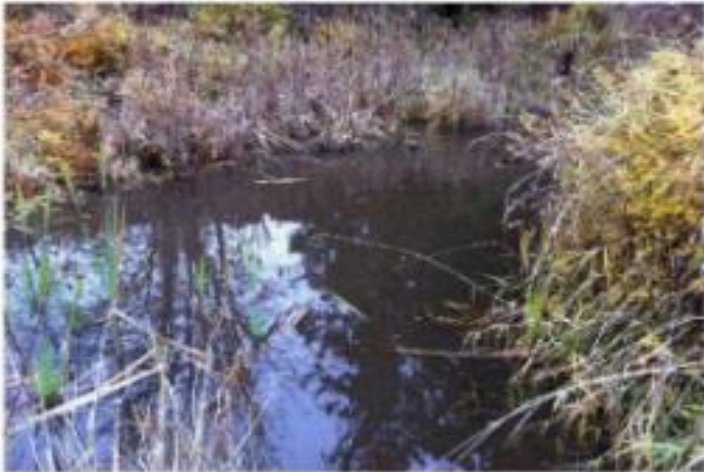
Shelly Creek R2