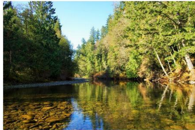
Reach E5 US