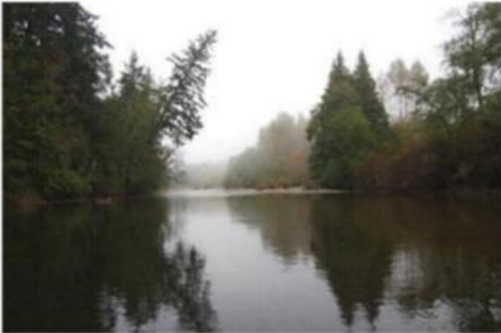
Reach E2 DS