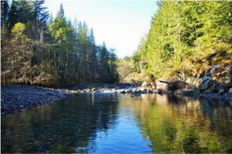
Reach E10 US