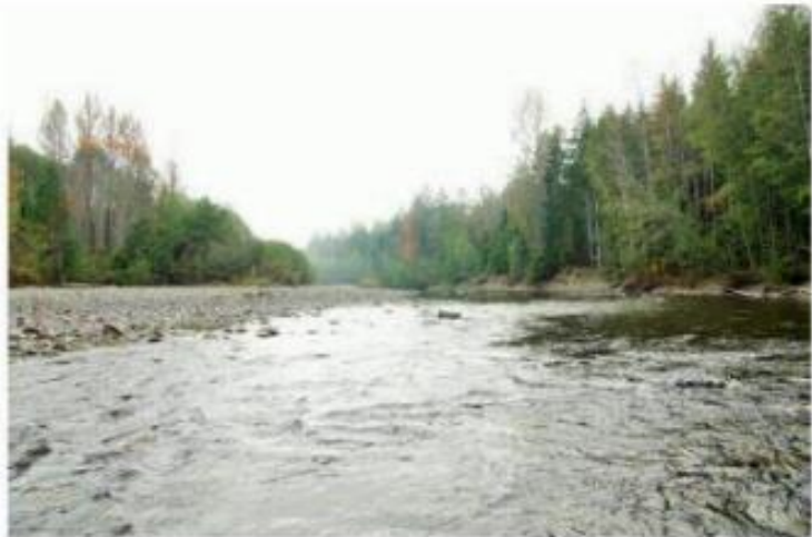
Reach E3 US