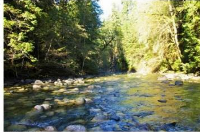
Reach E6 DS