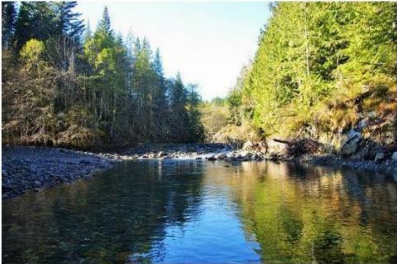
S. Eng. R. DS