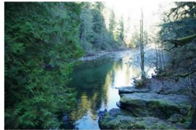
Reach E7 DS