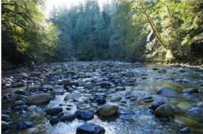
Reach E6 US