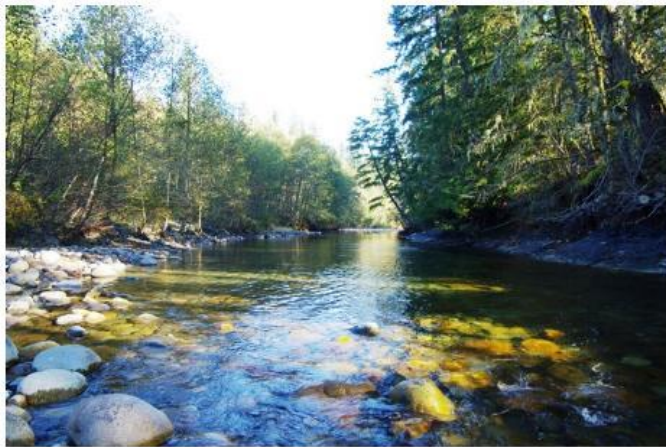
Reach E5 DS