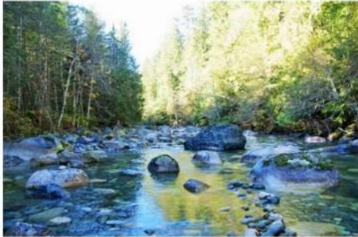
Reach E8 US