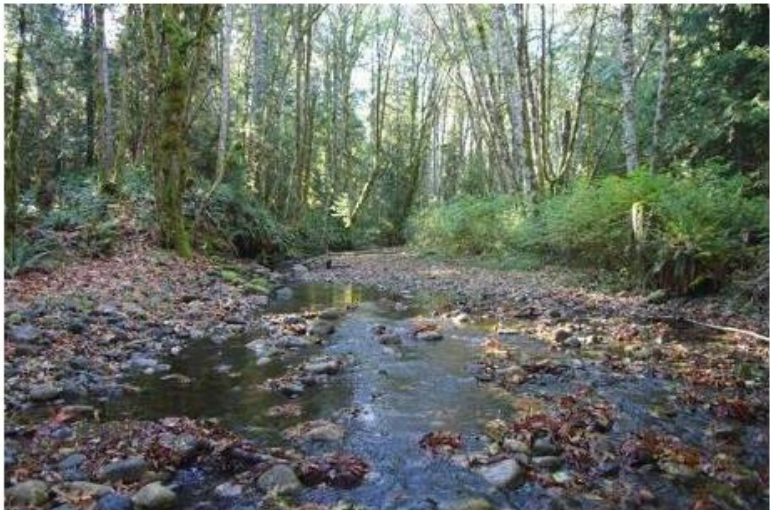
Centre Ck US