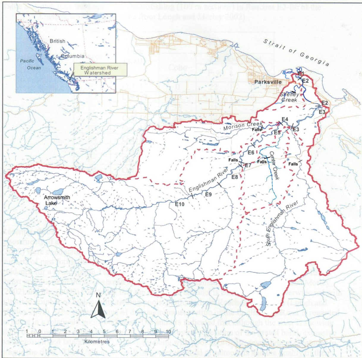
Figure 1: Englishman River Watershed with Reach Breaks. 3