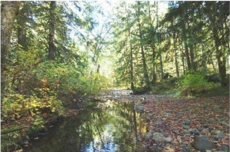
Centre Ck US