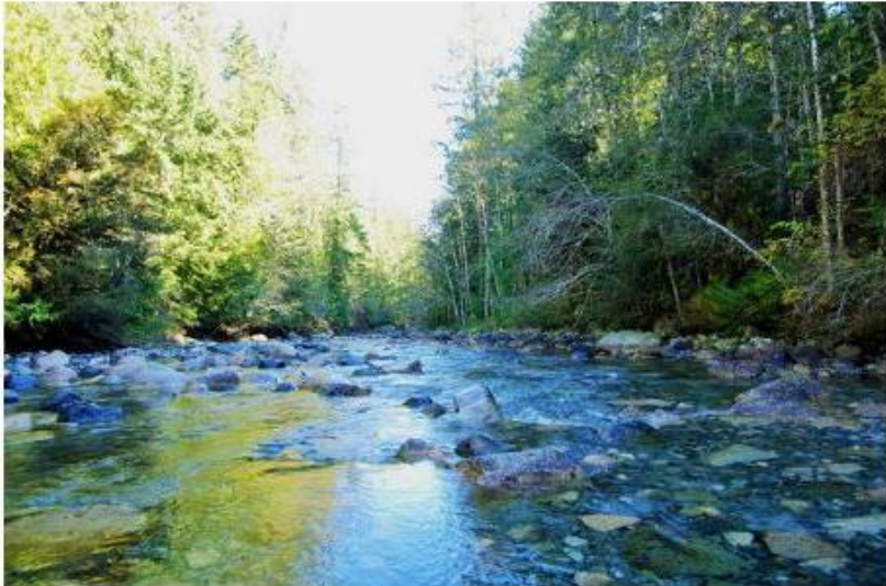
Reach E10 DS