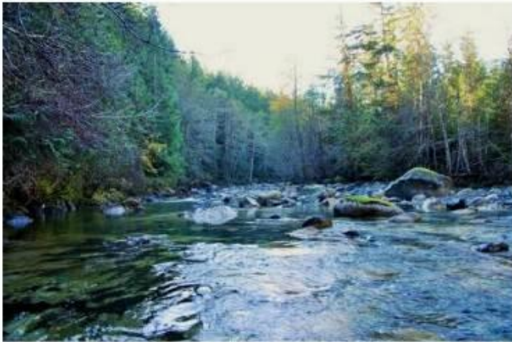
Reach E9 DS