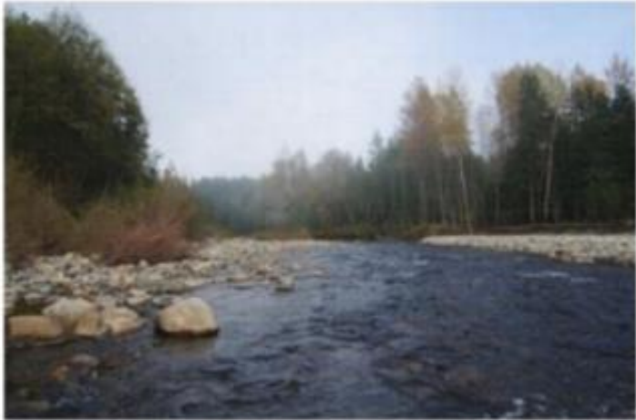
Reach E3 DS