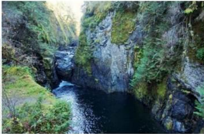
Reach E7 US